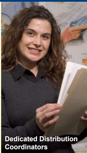
Dedicated Distribution Coordinators