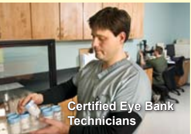
Certified Eye Bank Technicians