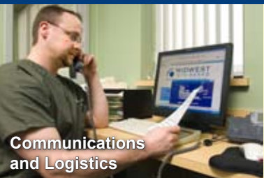
Communications and Logistics